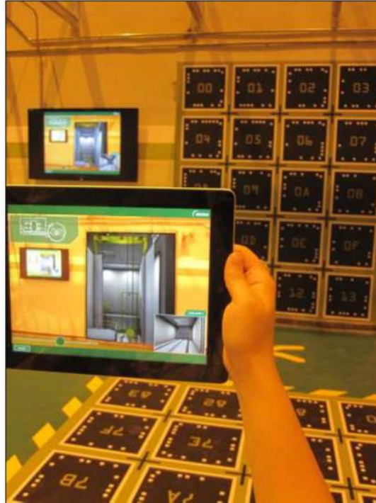
Figure 1.1.: Example of Virtual Reality Application on Tablet

Audio-visual media was given close attention and, specifically, a virtual reality application was developed to allow the visitors to enter the different areas of the facility during the visit ( Figure 1.1 ).