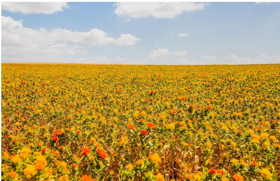
Figure 1: Safflower crop

Cultivated safflower ( Carthamus tinctorius L.) is an annual oilseed crop (Figure 1) that is a member of the family Asteraceae (Compositae), tribe Cardueae (thistles) and subtribe Centaureinae (Bérvillé et al., 2005). Asteraceae is recognised as the largest family of flowering plants and contains more than 1 500 genera and 22 000 species ranging from annual herbs to woody shrubs. Safflower is known by many other names, such as kusum, kasunmba, kusumbo, kusubi, kabri, ma, sufir, kar/karar, sendurgam, agnisikha, hebu, su, suban, and others. The Arabic usfur is thought to have been the root for the English name via a number of other terms – affore, asfiore, asfrole, astifore, asfiori, zaffrole or zaffrone, saffiore to finally, safflower – while in the People’s Republic of China (hereafter ‘China’) it is known as hung-hua or ‘red flower’ (Chavan, 1961, and sources cited therein), and under many other names around the world as summarised by Smith (1996).