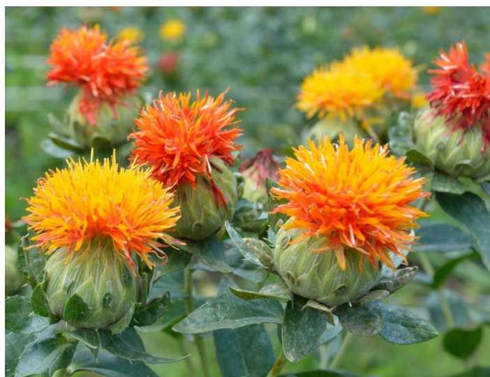
Figure 2: Flowers of cultivated safflower

Safflower is an erect, herbaceous, highly branched, spiny, thistle-like annual plant that grows from 30 to 150 cm in height (Singh and Nimbkar, 2006; Kumar and Kumari, 2011). Young safflower plants form a rosette and remain in this vegetative state for many weeks, during which leaves and a deep taproot system develop. This deep taproot system, with abundant thin horizontal roots, allows the plant to extract water and nutrients from deeper layers of soil than many other crop plants (Li and Mündel, 1996; GRDC, 2010). The rosette stage is followed by rapid stem elongation, extensive branching then flowering, with leaves being arranged on both sides of the stem (Li and Mündel, 1996; Singh and Nimbkar, 2006). The flower colour of cultivated safflower is typically brilliant orange (Figure 2). Leaf size varies with variety and position on the plant, although typical leaves are 2.5-5 cm wide and 10-15 cm long. The leaf morphology is described as alternate, sessile and ovate-lanceolate (Teotia et al., 2017). Upper leaves often develop hard spines, while those lower on the stem are usually spineless. These spines make the crop difficult to walk through, but act as a deterrent to larger animals such as pigs and kangaroos (GRDC, 2010). As plants mature they become stiff and woody and resistant to some environmental stressors such as hail and wind. Safflower growth cycle, floral biology and pollination are considered in greater detail in Section 2 below.