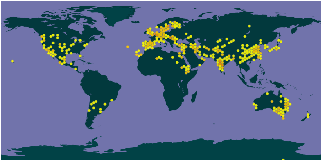
Figure 3: Recorded global distribution of cultivated safflower ( Carthamus tinctorius L.) from 1795 until 2019

Note: Yellow (or light grey) dots indicate georeferenced occurrences.