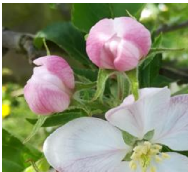
Figure 17458. Open king flower and closed lateral flowers

Flowering is affected by many biotic (endogenous phytohormones, previous year's crop load, pathogens and pests) and abiotic (light, water stress, nutrients, temperature and exogenously applied chemicals) factors. Also cultivation practices drive flowering and include: grafting, pruning, scoring and/or ringing the base of the tree (Jackson, 2003). The flowering period can significantly differ between cultivars. The difference in flowering time between commercial cultivars and local cultivars can be more than one month in colder temperate regions (e.g., North West Europe) and about 2-3 weeks in warmer regions (e.g., South Europe).