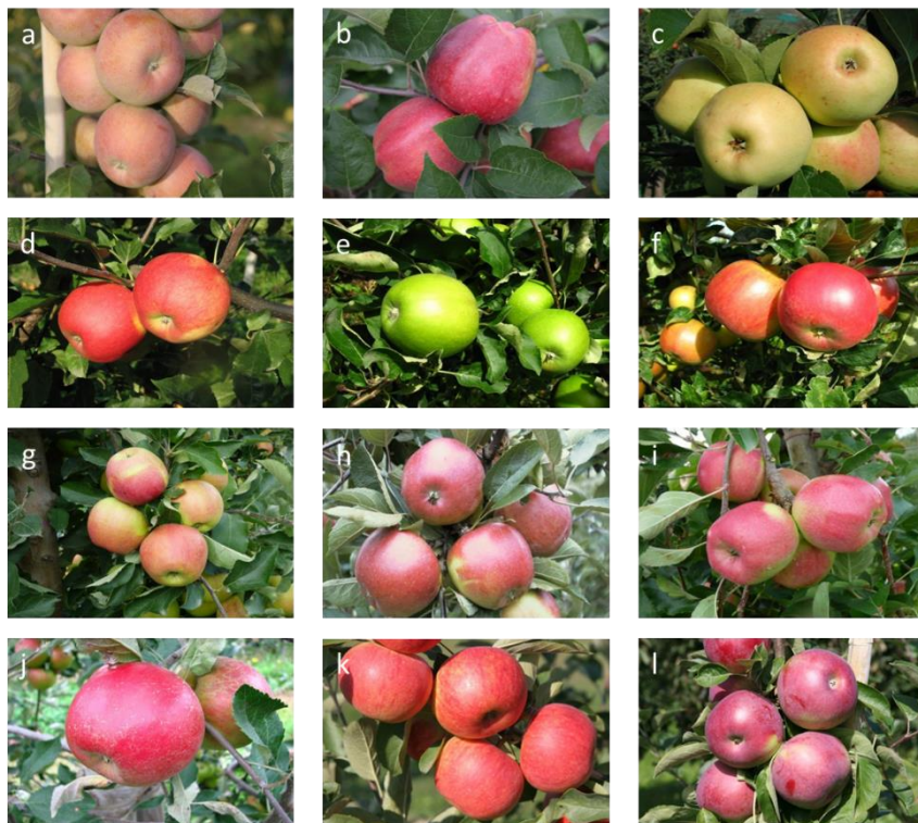
Figure 2. Commercially grown apple cultivars

Note: (a) ‘Fuji’, (b) ‘Delicious’, (c) ‘Golden Delicious’, (d) ‘Gala’, (e) ‘Granny Smith’, (f) ‘Idared’, (g) ‘Jonagold’, (h) ‘Braeburn’, (i) ‘Cripps Pink’, (j) ‘Jonathan’, (k) ‘Elstar’ and (l) ‘McIntosh’.