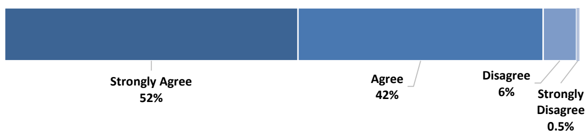
Figure 2: Overall degree of agreement

Comments made during the webinars and via e-mail confirm an overall high-level of agreement, with principles considered as useful and timely. Participants also expressed a positive appreciation of the consultation process, which allowed an open and diversified participation.